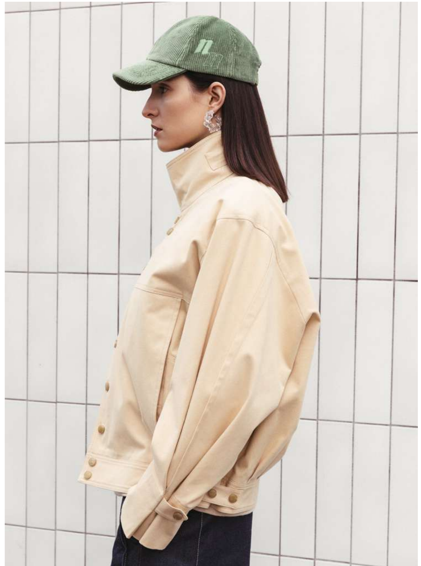
15. JOZEFINA butter beige cotton unisex jacket | POMALA indigo blue soft touch denim sculptural jeans TORO light beige double-faced alpaca wool top | TAKIKO 2 natural soft cotton rib rollneck AIRI willow green cotton corduroy cap