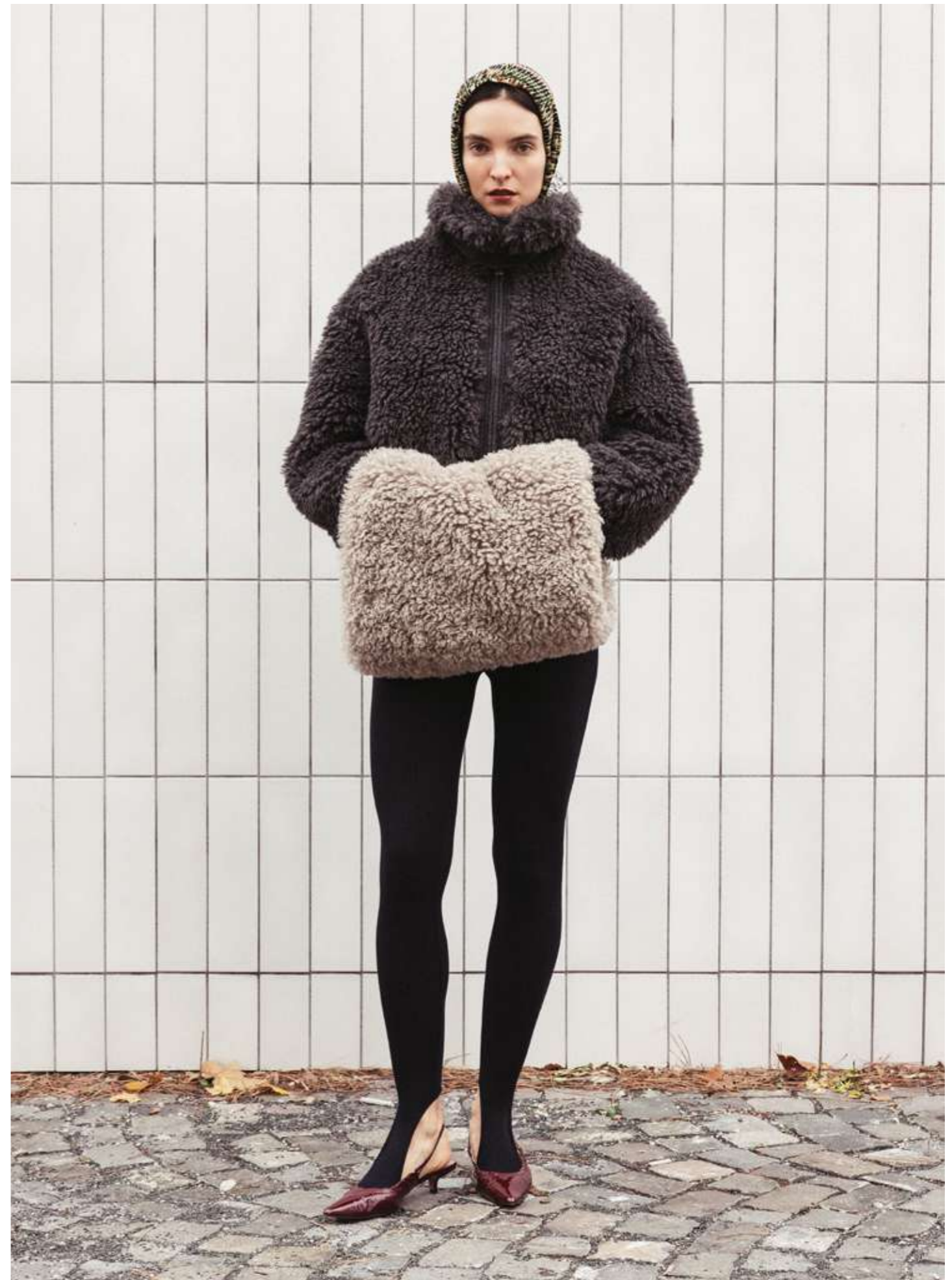
20. CELESTE 1 charcoal black faux alpaca fur coat | PORTHOS navy thin jersey wool leggings K4404 green mix fine viscose chenille scarf