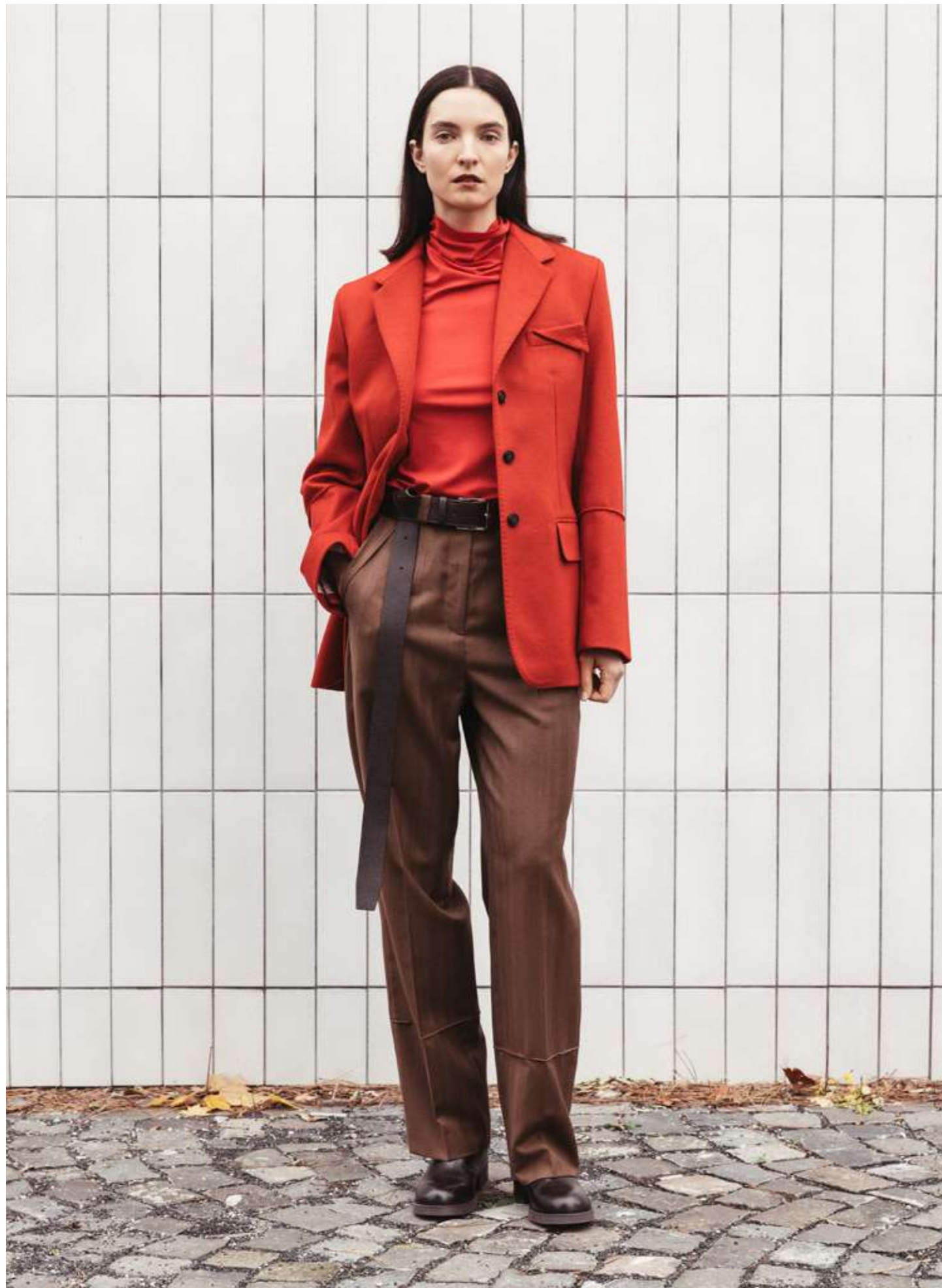
24. JORG orange red wool cashmere coat jacket | TADE fiery red fluid viscose jersey rollneck top PALMIRA caramel herringbone suiting tailored pants | ARIS dark brown soft bovine leather belt