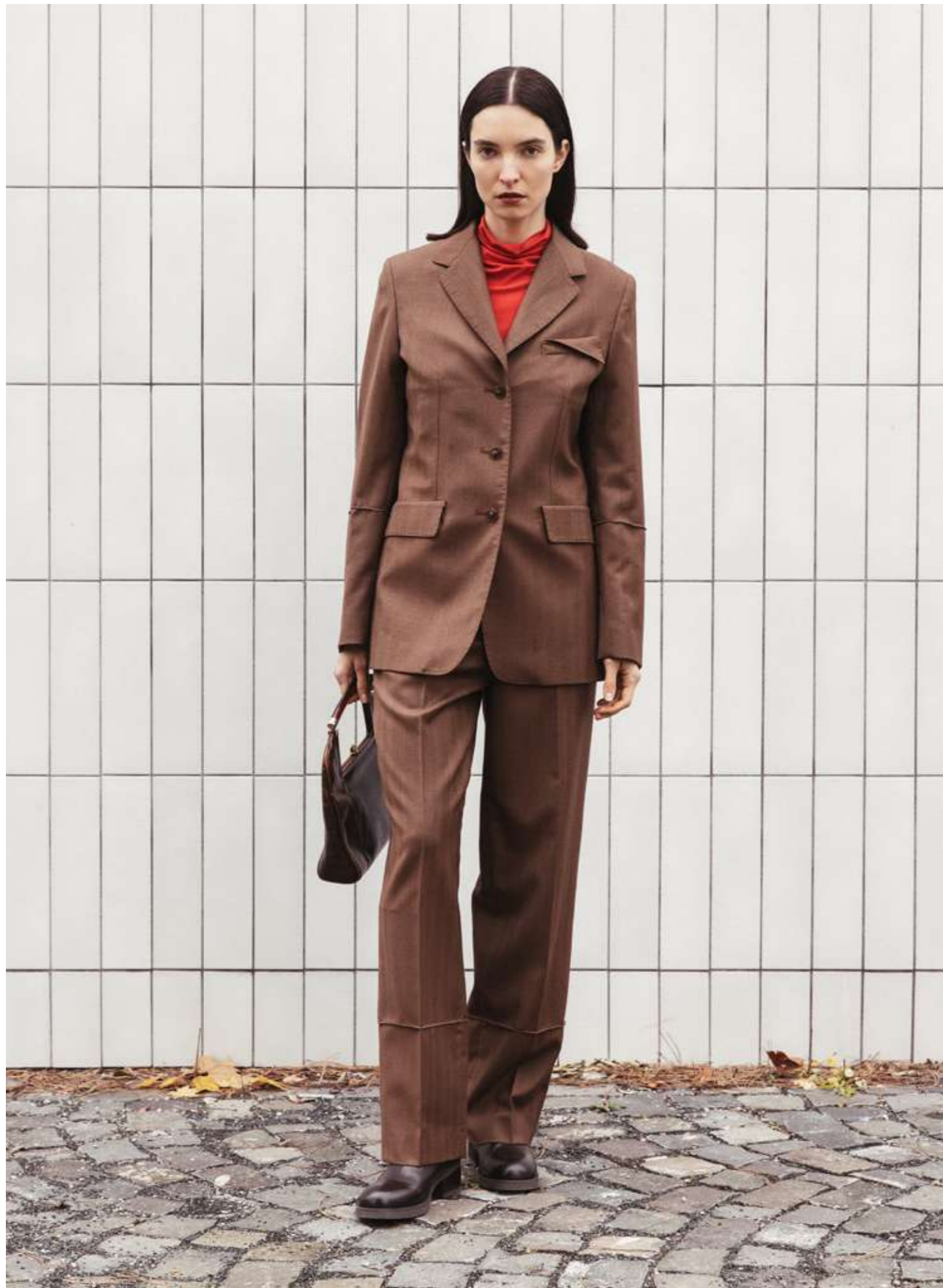
26. JORGA caramel herringbone suiting tailored jacket | TADE fiery red fluid viscose jersey rollneck top PALMIRA caramel herringbone suiting tailored pants