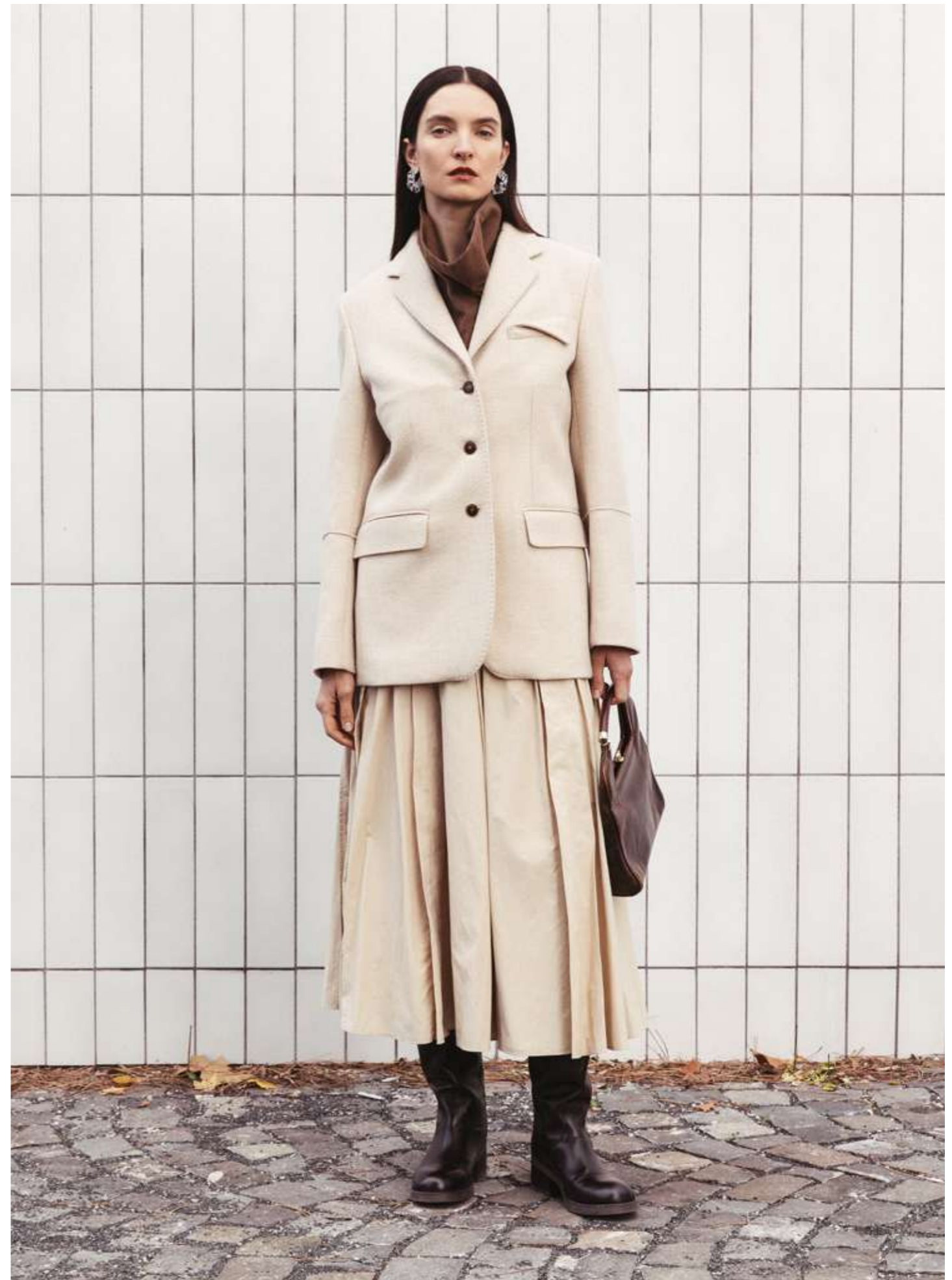
12. JORG light beige double-faced alpaca wool tailored coat jacket | BARB caramel herringbone suiting blouse STACHO butter beige crinkle effect tech skirt