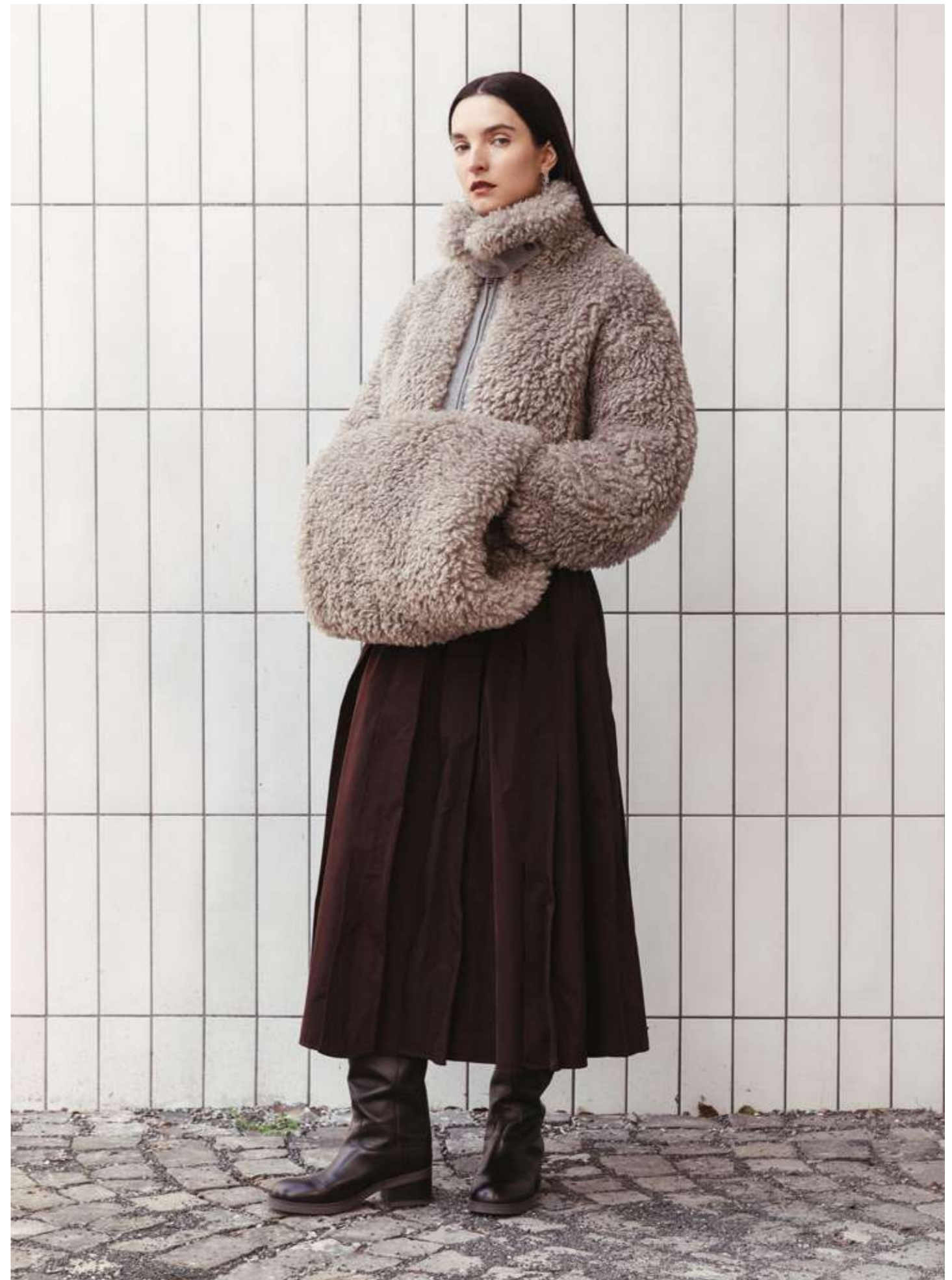
14. CELESTE 1 light taupe faux alpaca fur short coat | STACHO wine red water-repellent skirt