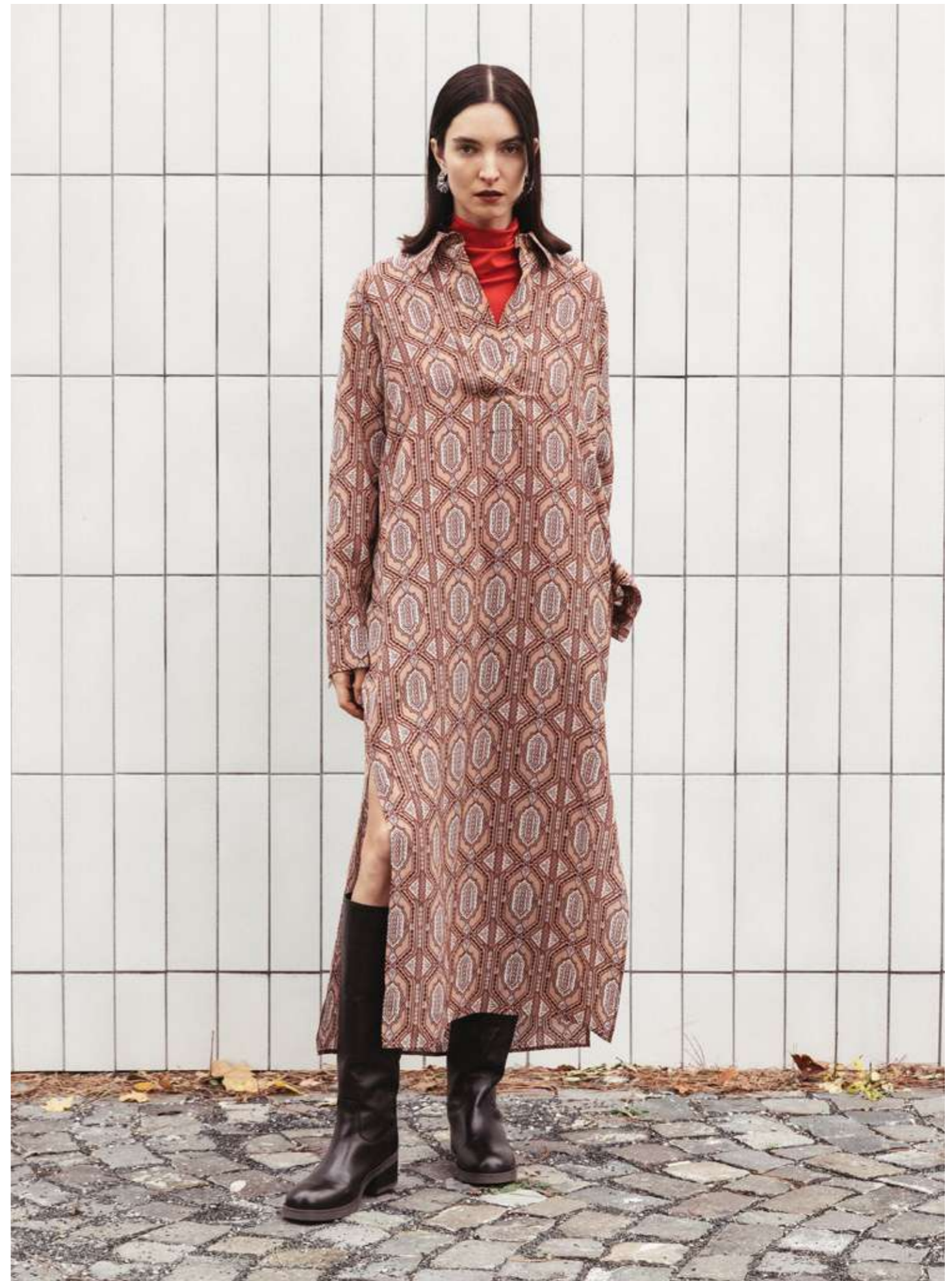
25. DILIA beige with pattern foulard silk print dress | TADE fiery red fluid viscose jersey rollneck top