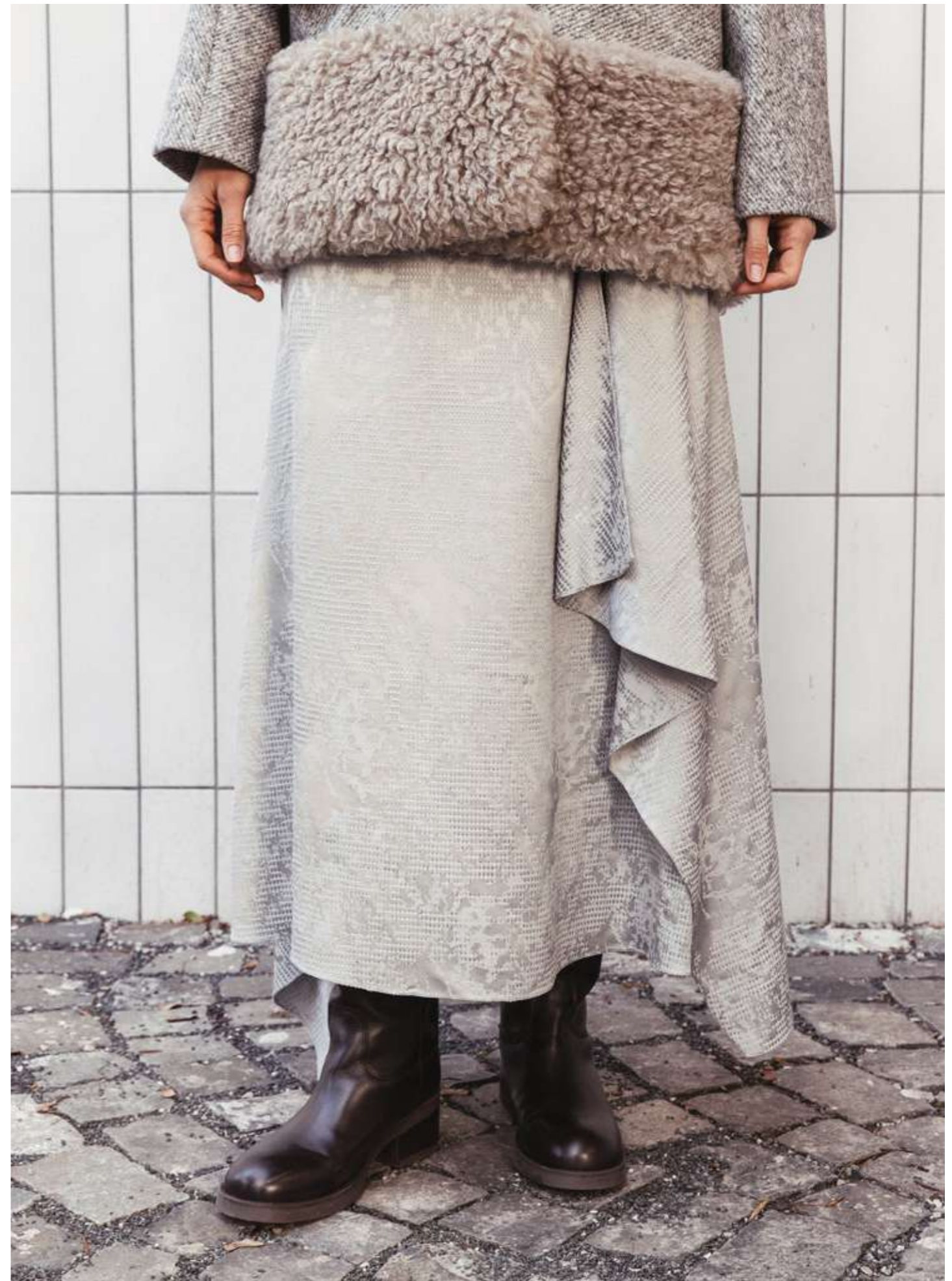
18. CARDIF grey&taupe heavy jersey faux fur coat | DAMARA silver waffle texture viscose fluid dress