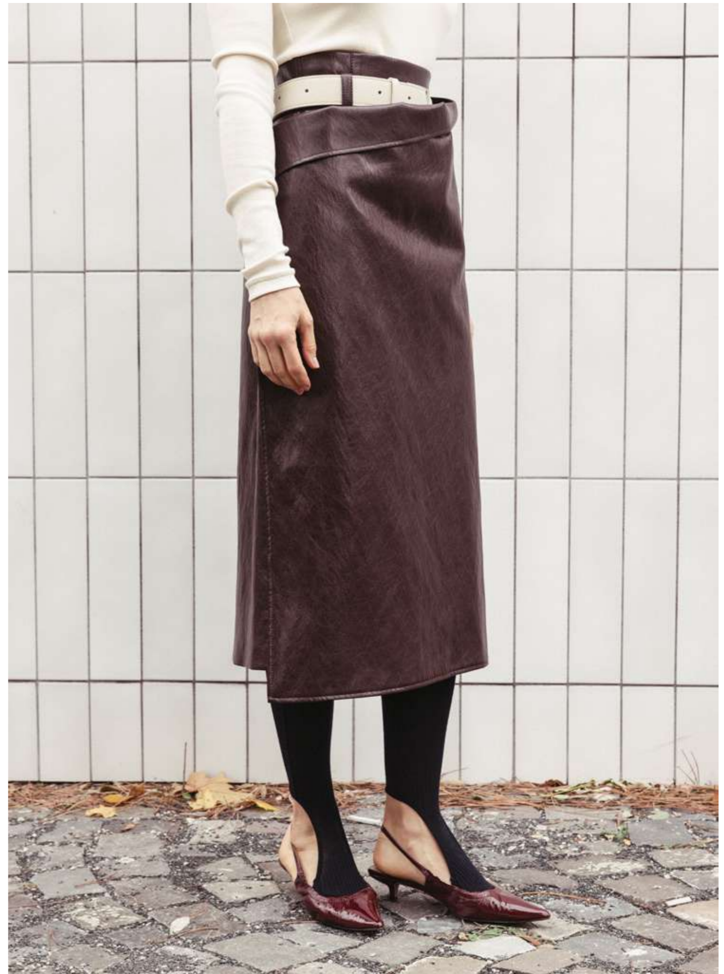
8. TAKIKO 2 natural soft cotton rib rollneck | SIDOR burgundy faux leather skirt ARA light beige soft bovine leather belt | AIRI black cotton corduroy cap