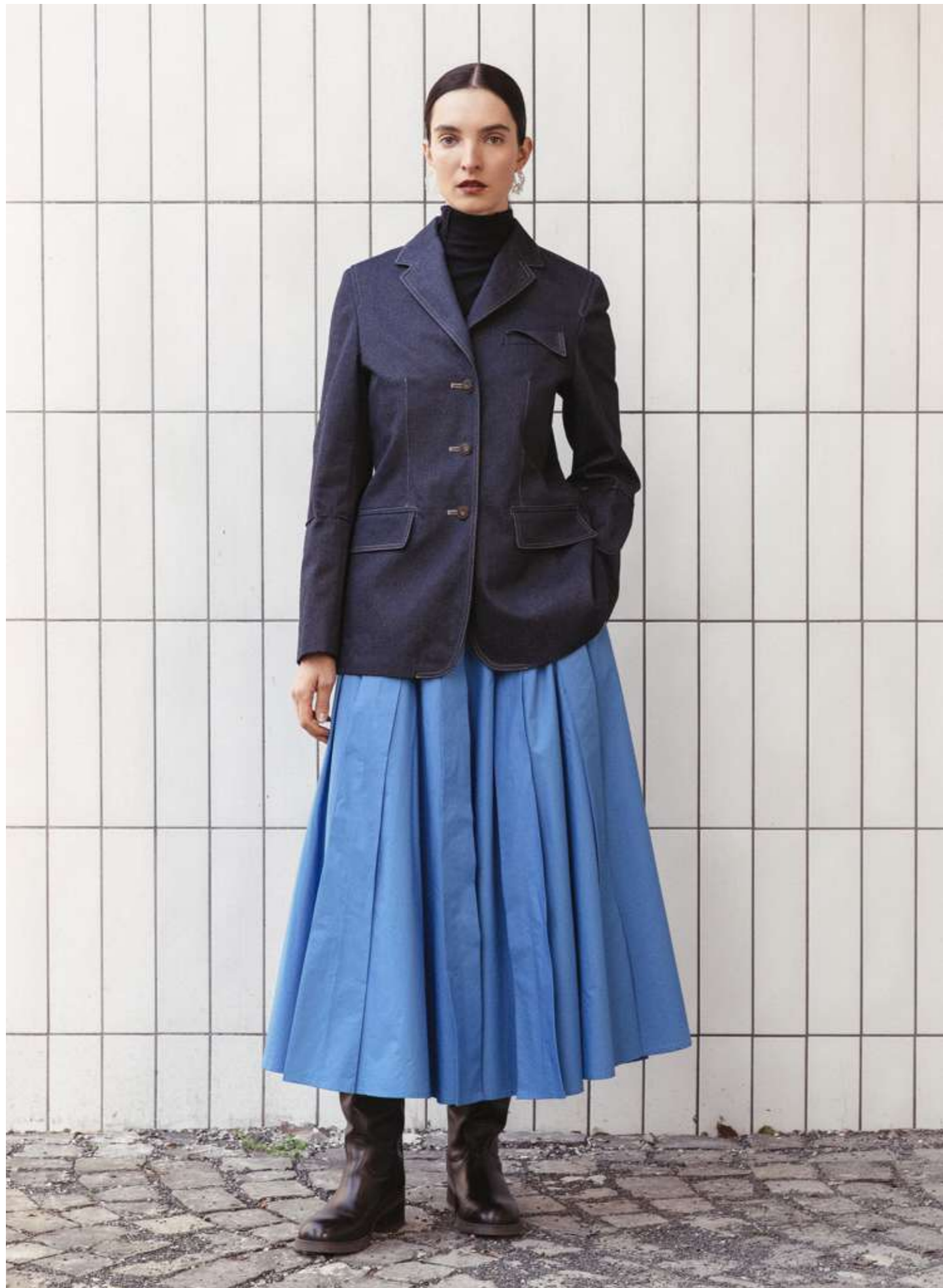
13. JORG indigo blue soft touch denim coat jacket | STACHO cobalt blue luxury cotton poplin skirt TAKIKO 2 navy thin wool jersey rollneck