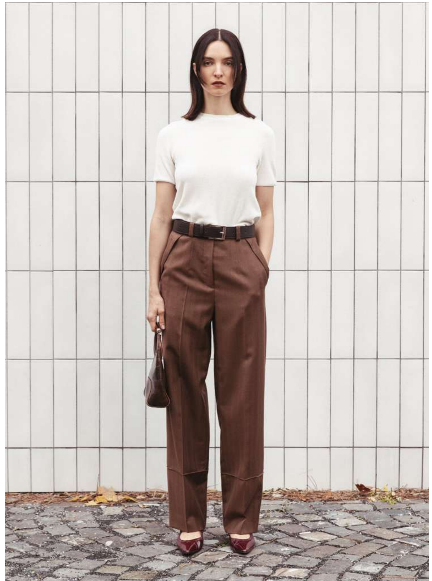
4. K4403 off white fine viscose chenille top | PALMIRA caramel herringbone tailored pants ARA dark brown soft bovine leather belt