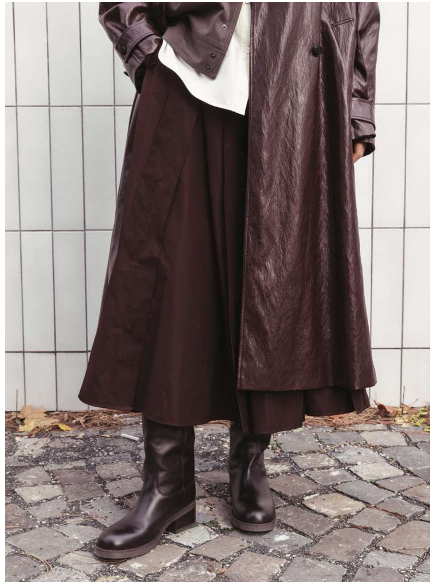
21. CURT 1 burgundy faux leather trench coat | JOZEFINA earth brown cotton unisex urban jacket STACHO wine red water-repellent skirt | BOGDAN vanilla crispy cotton poplin shirt AIRI butter beige peach touch cotton cap