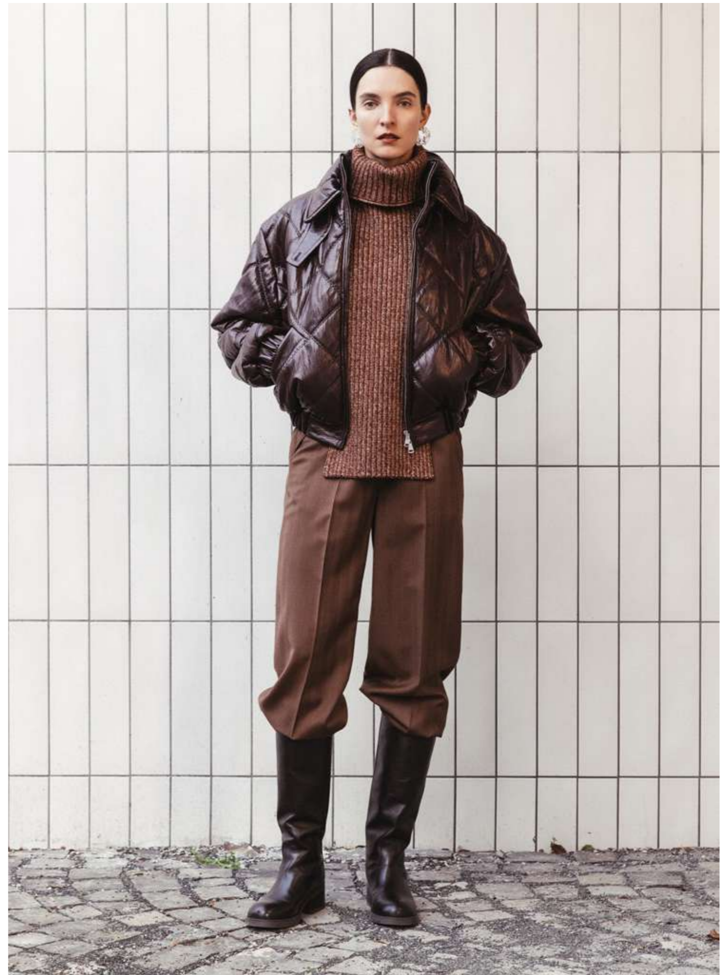
27. CELESTE burgundy faux leather quilt short coat | K4408 toffee brown cotton merino blend scarf PALMIRA caramel herringbone suiting tailored pants