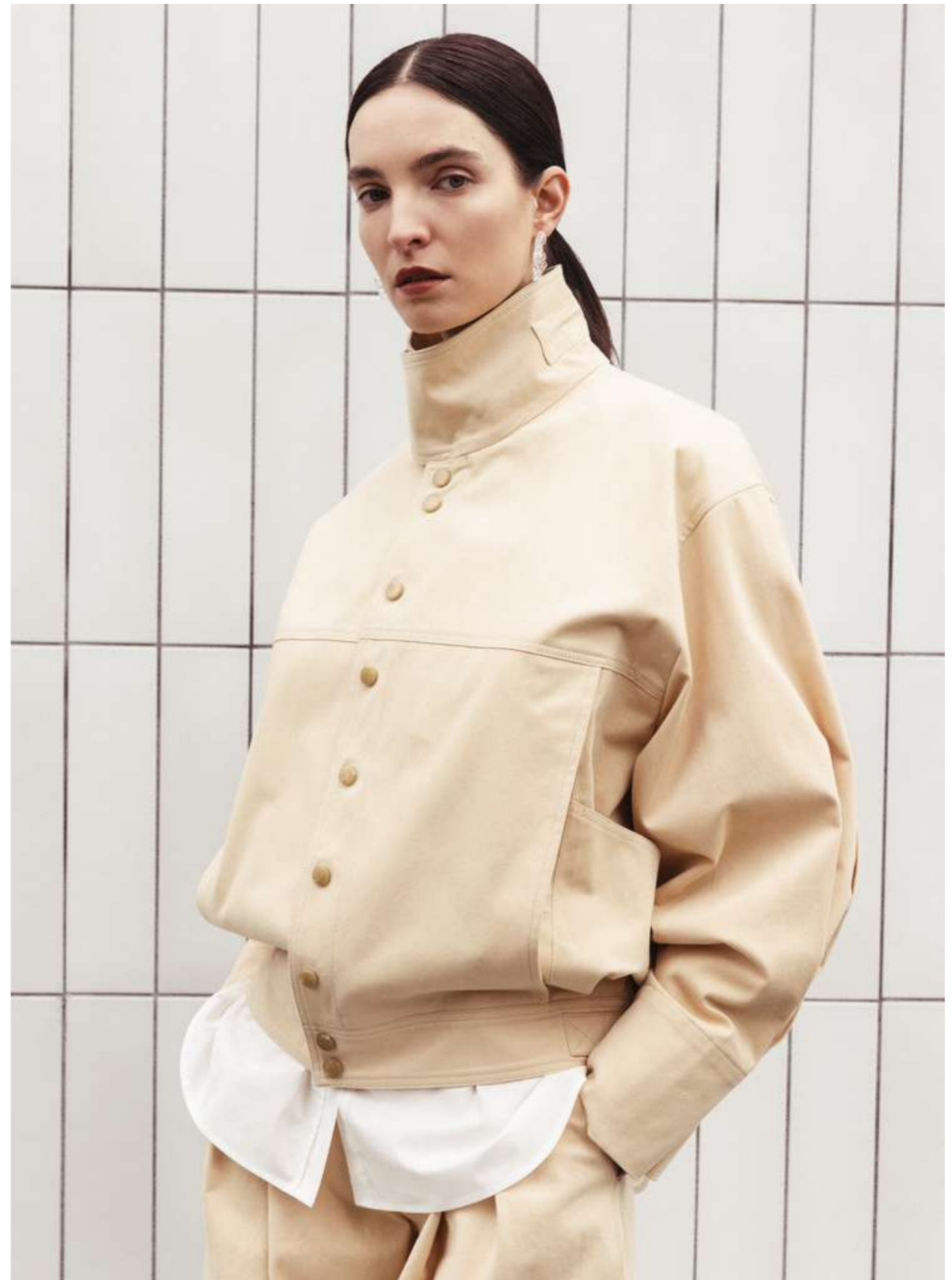
23. JOZEFINA butter beige cotton unisex jacket | BOGDAN off white cotton crispy poplin shirt PAYON butter beige cotton paper-bag pants