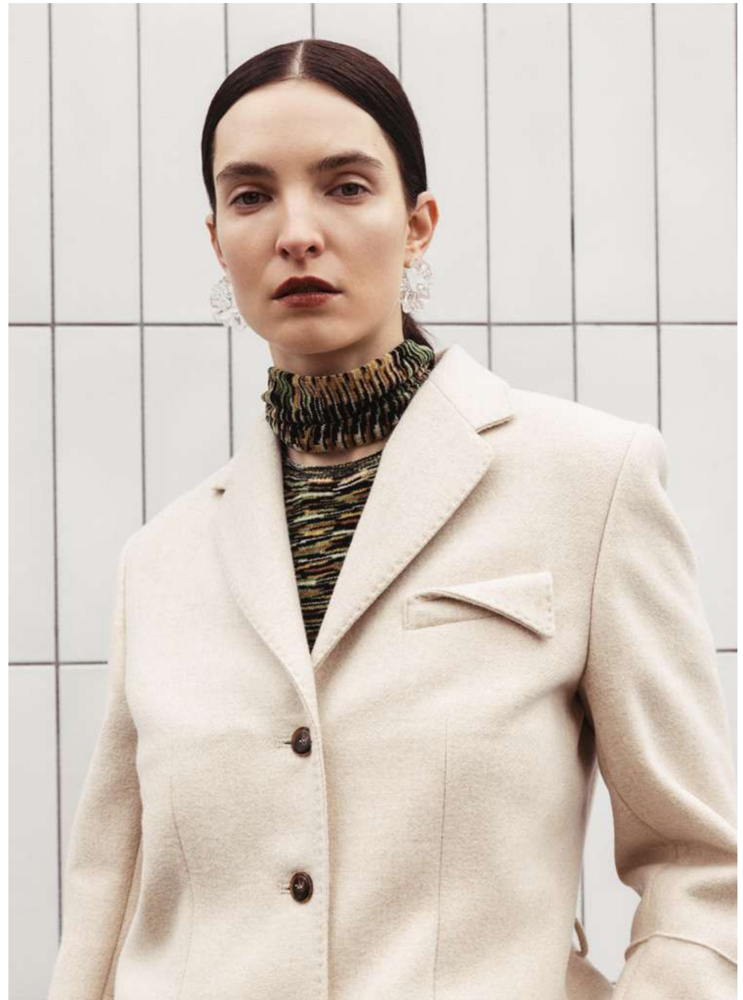
10.JORG light beige double-faced alpaca wool tailored coat jacket | K4403 green mix fine viscose chenille top K4404 green mix fine viscose chenille scarf | PALMIRA 1 indigo blue soft touch denim pants