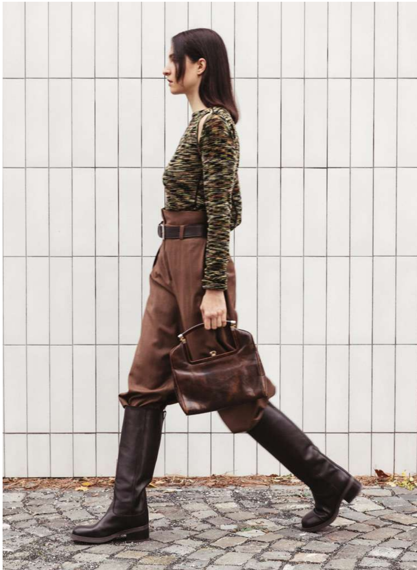
3. K4401 green mix fine viscose chenille top | PAYON caramel herringbone paper-bag pants ARIS dark brown soft bovine leather belt