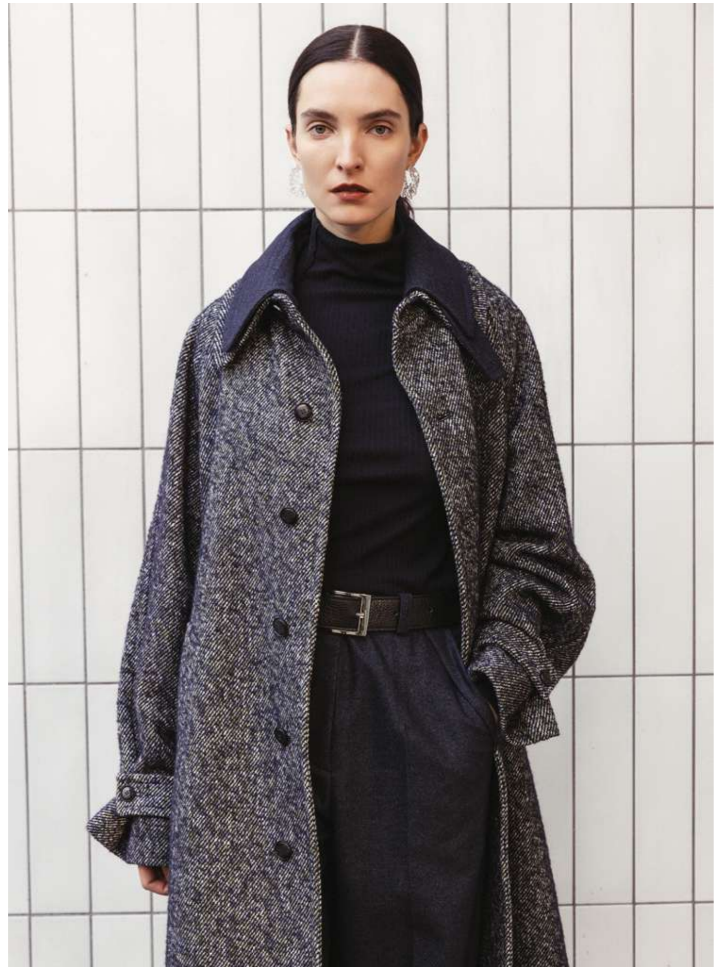
28. COMMETA navy&green double collar unisex twill coat | TAKIKO 2 navy thin wool jersey rollneck PALMIRA navy green mélange soft wool blend tailored pants | ARA black soft bovine leather belt