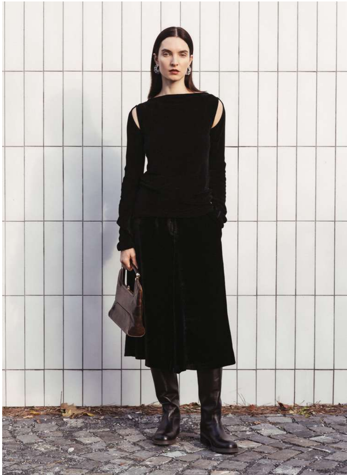
19. K4401 black fine viscose chenille top | PRANAV black silk viscose velvet fluid shorts