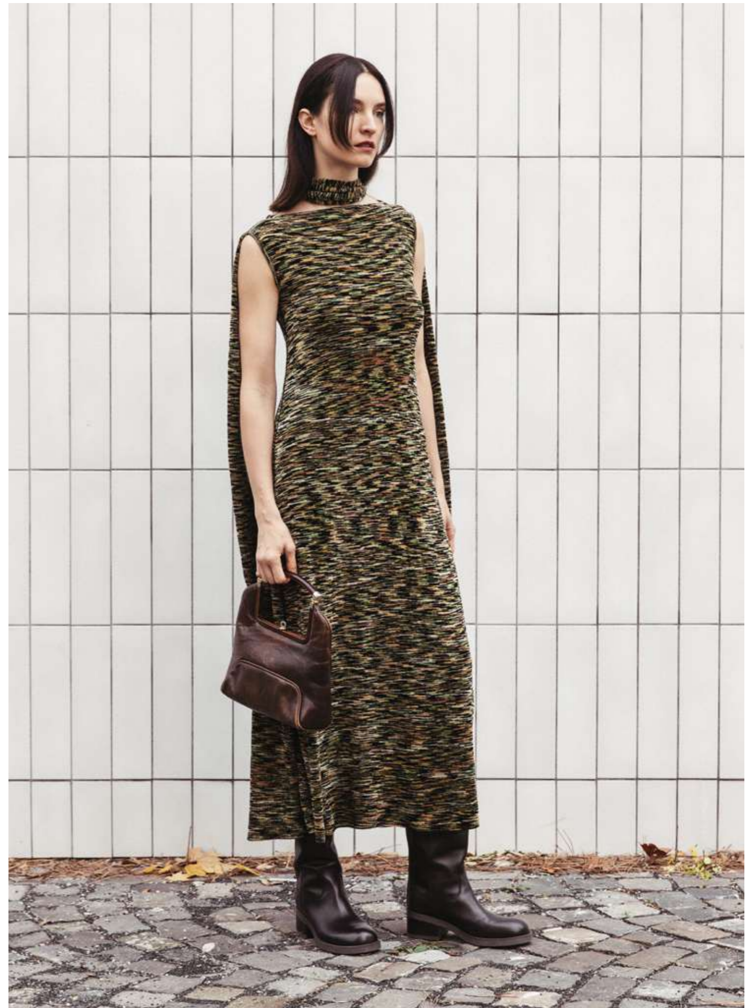
2. K4402 green mix fine viscose chenille dress | K4404 green mix fine viscose chenille scarf