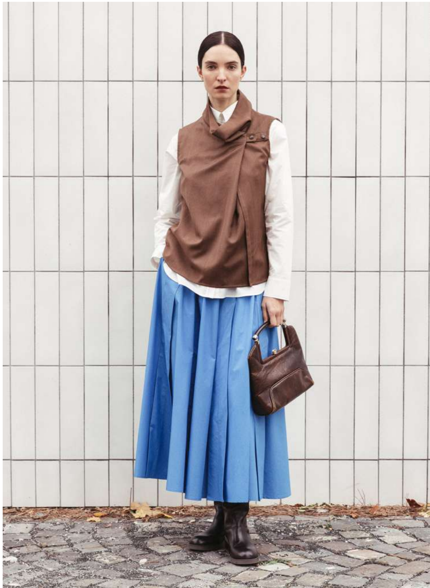
6. BARB caramel herringbone suiting blouse | BOGDAN off white cotton crispy poplin shirt STACHO cobalt blue luxury cotton poplin skirt