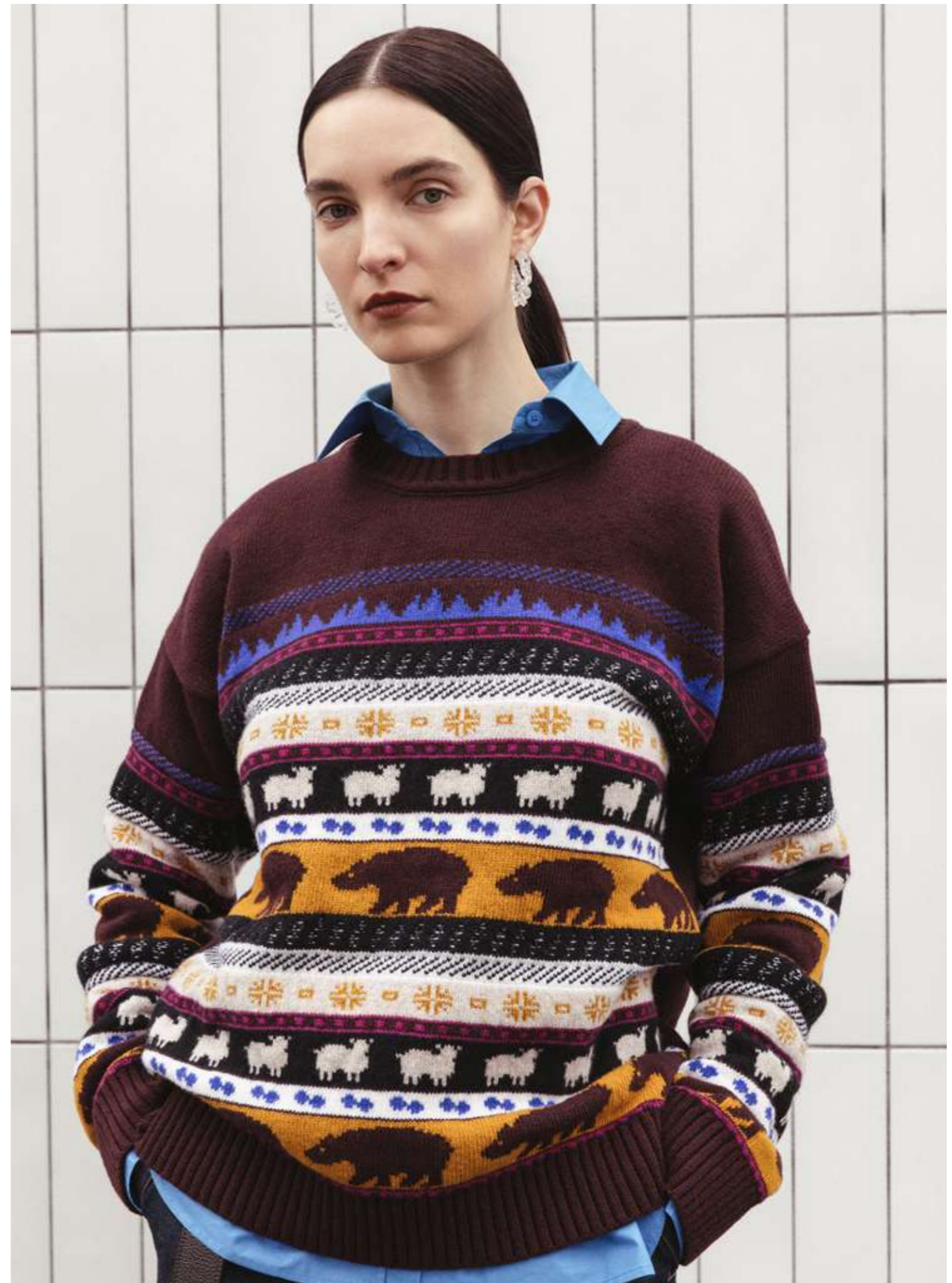
9. BOGDAN cobalt blue luxury cotton poplin shirt | K4410 dark mix extra fine merino holiday pullover PALMIRA 1 indigo blue soft touch denim pants | ARIS dark brown soft bovine leather belt