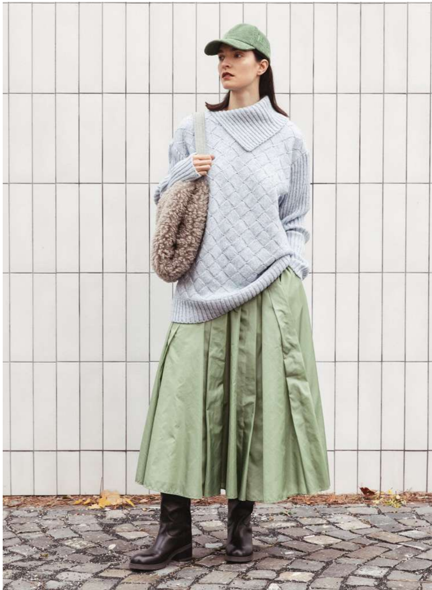
11. K4407 cloud blue cotton merino blend chunky pullover | STACHO willow green water repellent skirt AIRI willow green cotton corduroy cap