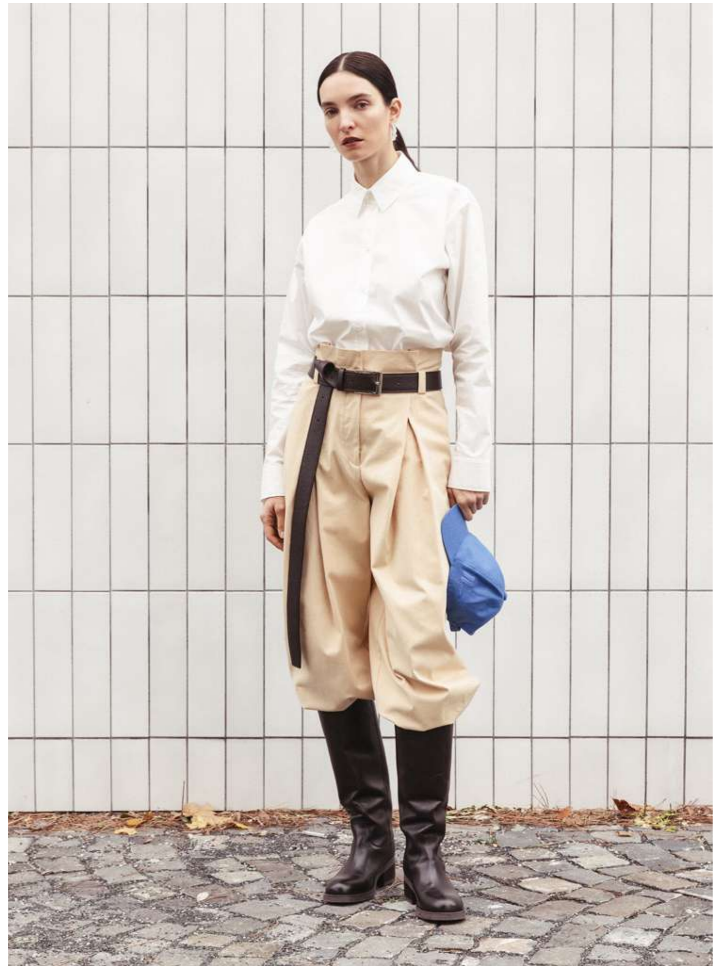
7. BOGDAN off white cotton crispy poplin shirt | PAYON butter beige cotton paper-bag pants ARIS dark brown soft bovine leather belt | AIRI cobalt blue merino wool flannel cap