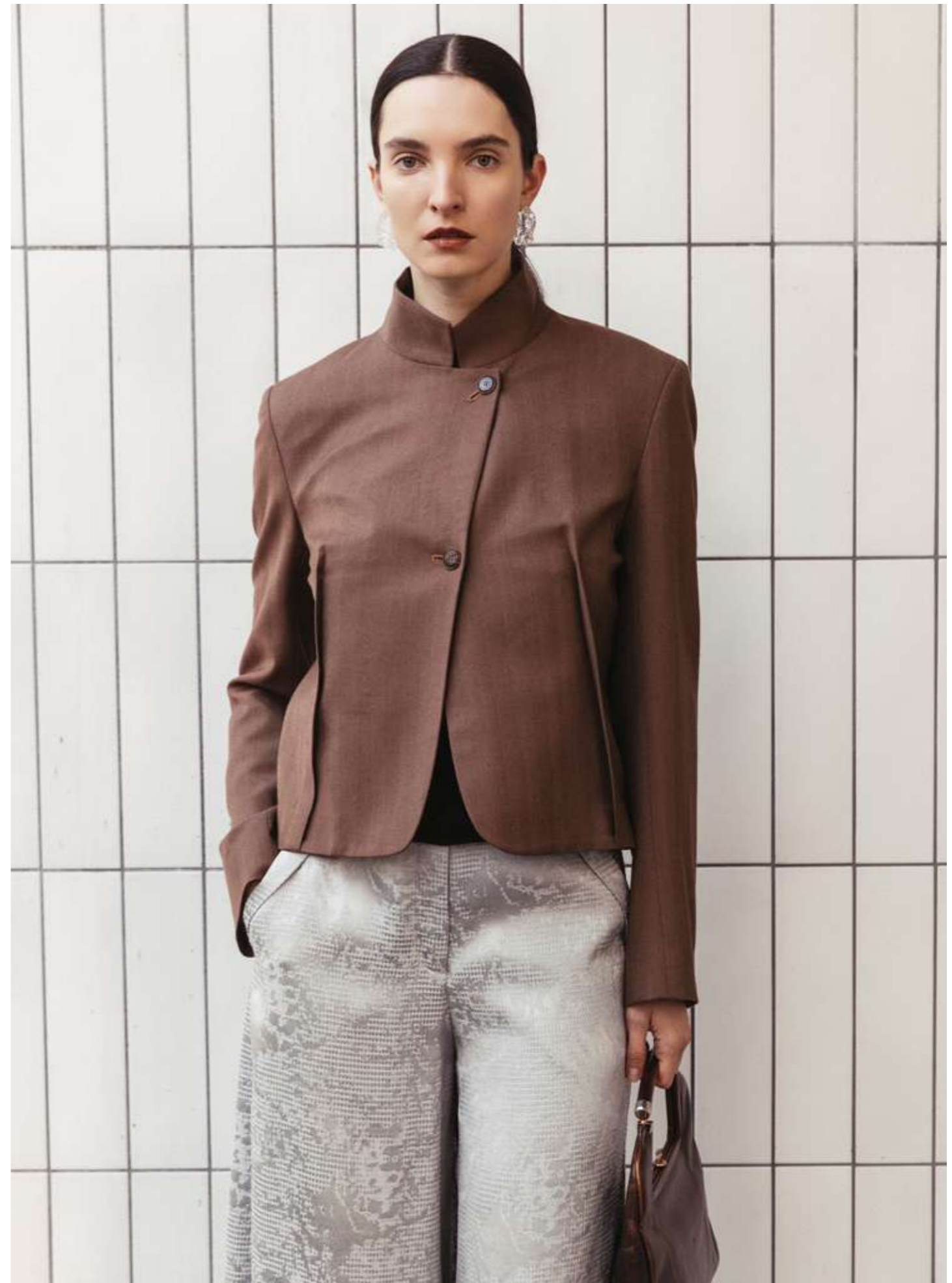
17. JANICE caramel herringbone suiting jacket | PRANAV silver waffle texture viscose fluid shorts K4403 black fine viscose chenille top