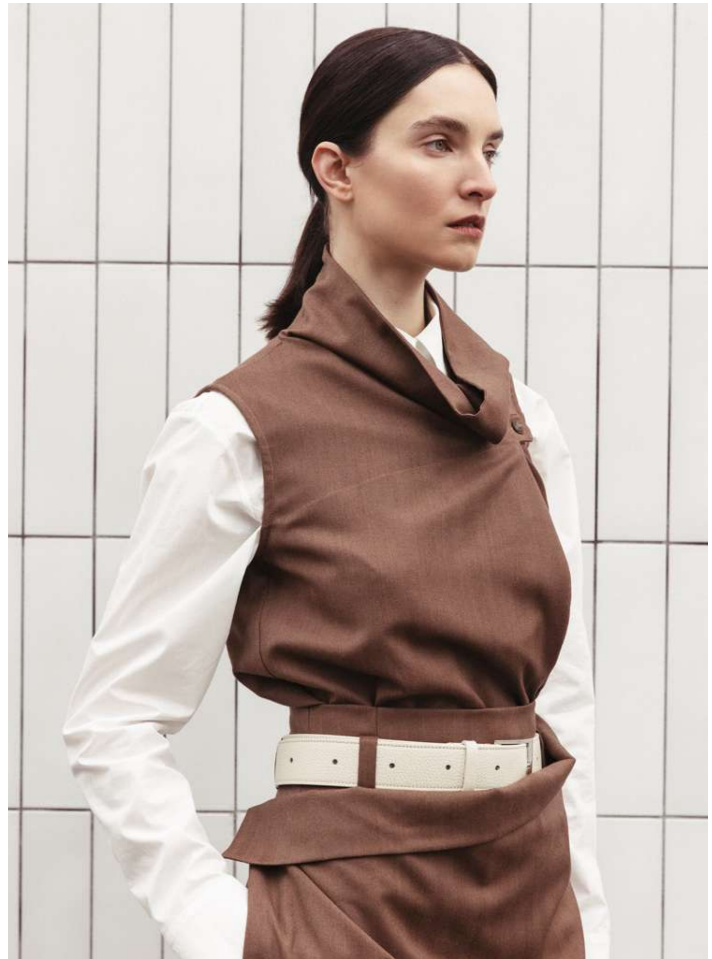
22. BARB caramel herringbone suiting blouse | BOGDAN off white cotton crispy poplin shirt SIDOR caramel herringbone suiting skirt | ARA light beige soft bovine leather belt