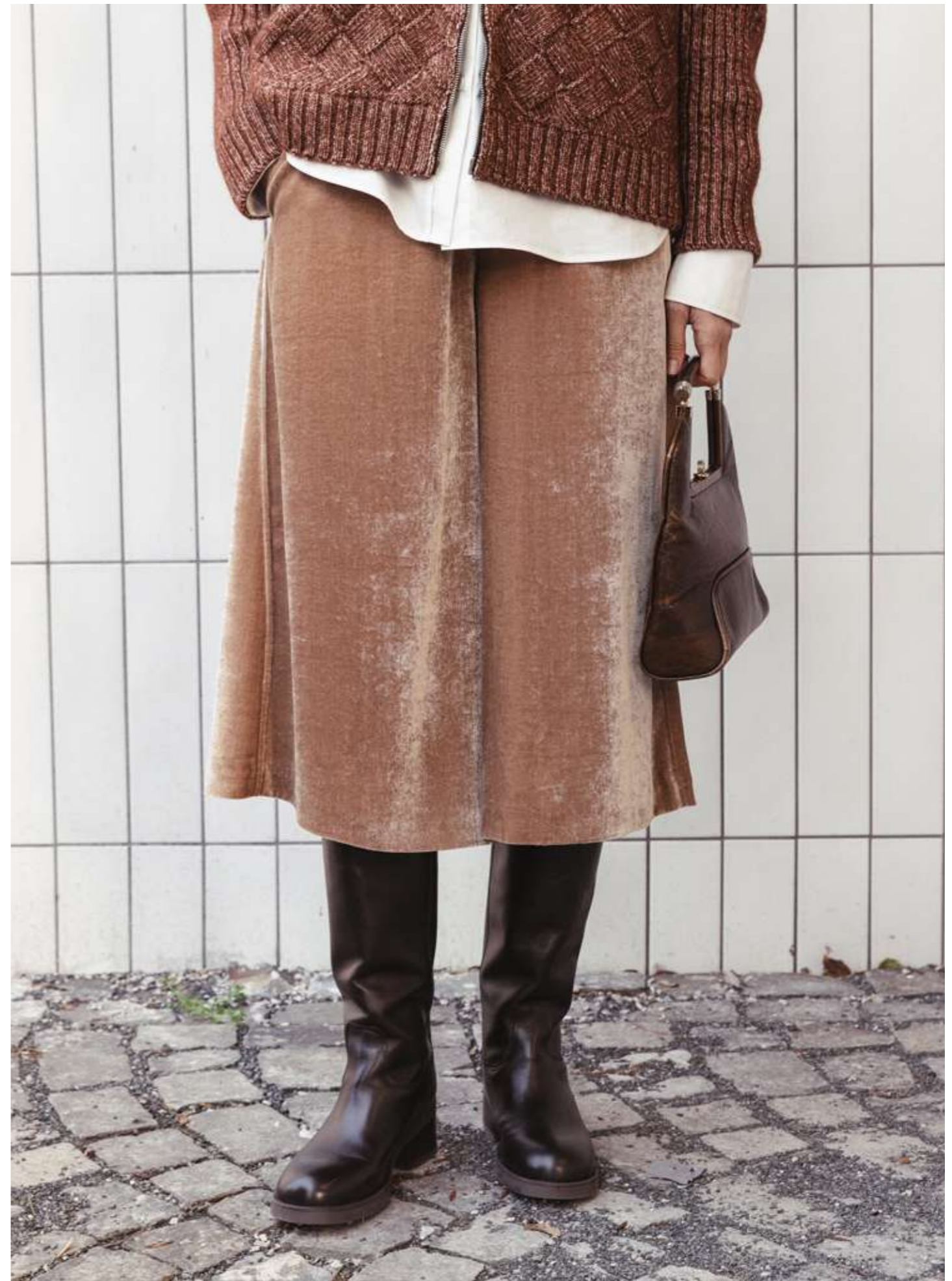
16. K4406 toffee brown cotton merino blend unisex cardigan | PRANAV beige red silk viscose velvet fluid shorts BOGDAN vanilla crispy cotton poplin shirt