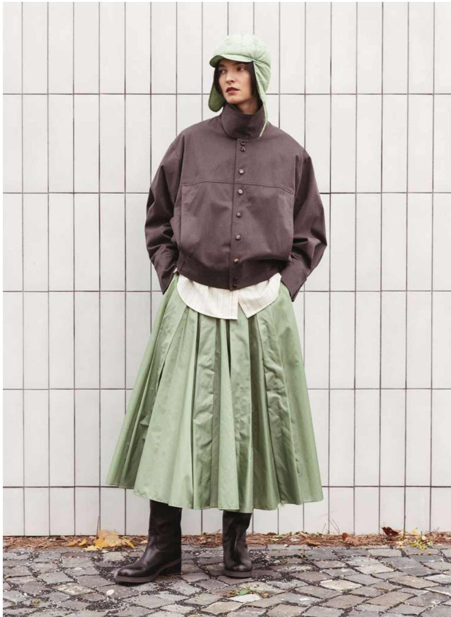
1. JOZEFINA earth brown cotton unisex urban jacket | BOGDAN snow white pinstripe soft wool shirt STACHO willow green water repellent skirt