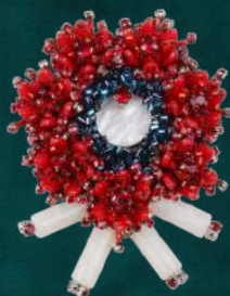
RED PAVIA BROOCH LB-RDPV-BO