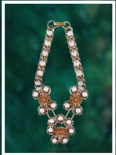
GIOVANNA NECKLACE LB-GVNN-N