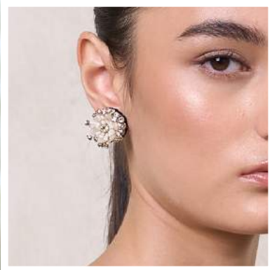
WHITE GELA EARRINGS LB-WTGL-E