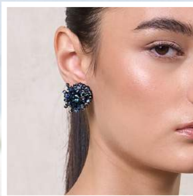
NAVY GELA EARRINGS LB-NVGL-E