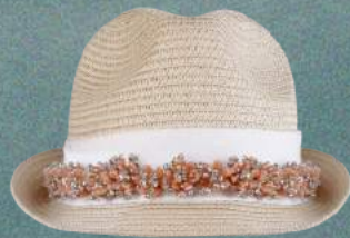
CREME GELA HAT N-CRMGL-HT