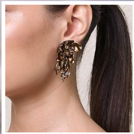
GOLDEN GIARDINO EARRINGS LB-GLGRN-E