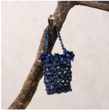
NAVY ROSA BAG LB-NVRS-BG