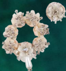
WHITE GELA BROOCH LB-WTGL-BO