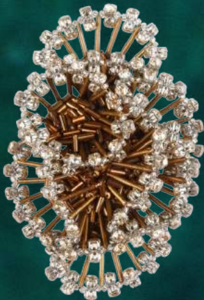
GOLD MORENA NECKLACE LB-GLMRN-N