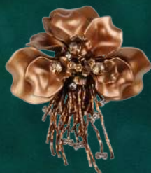
GOLDEN GIARDINO BROOCH LB-GLGRN-BO