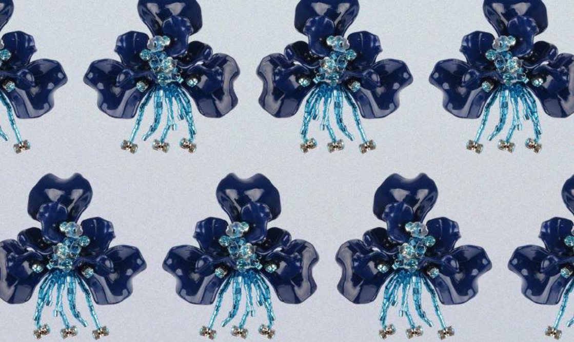
WHITE GIANNA EARRINGS LB-WTGAN-E