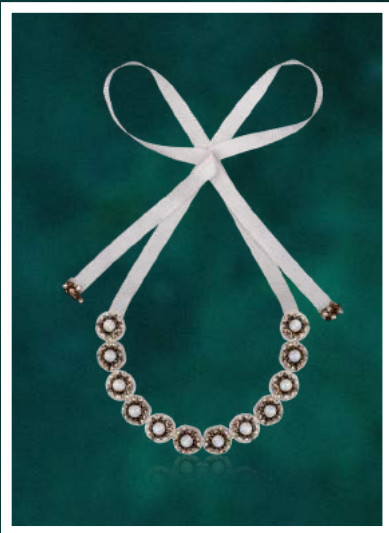
WHITE GELA CHOKER LB-WTGL-CK