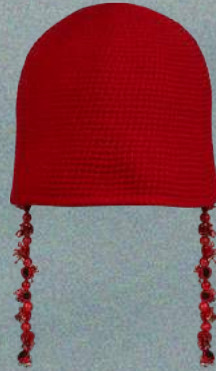
TANIA KNIT HAT LB-TNKNT-HT