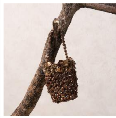
BROWN ROSA BAG LB-BRWRS-BG