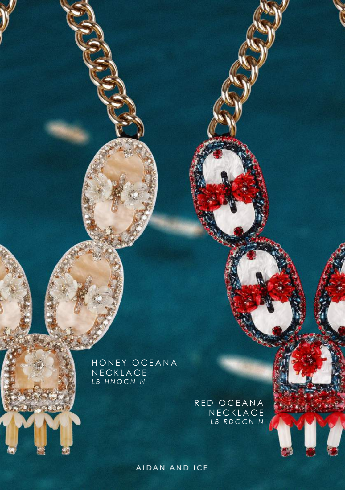
HONEY OCEANA NECKLACE LB-HNOCN-N