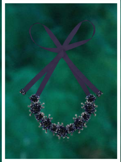
BLUE GELA CHOKER LB-BLUGL-CK