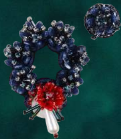
NAVY GELA BROOCH LB-NVGL-BO