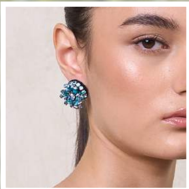
BLUE GELA EARRINGS LB-BLUGL-E