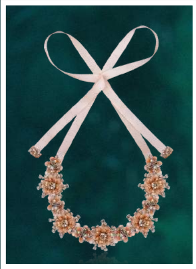
ROSE GELA CHOKER LB-RSGL-CK