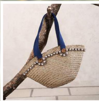
GIOVANNA STRAW BAG LB-GVNN-BG