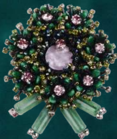
GREEN PAVIA BROOCH LB-GRPVS-BO