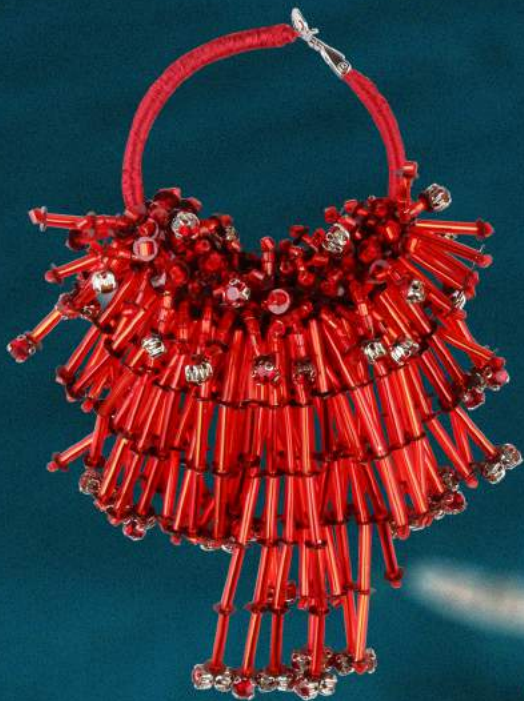
RED MARIA EARRINGS LB-RDMRA-E