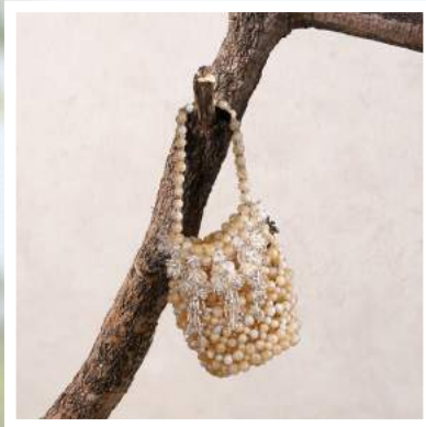
CREAM ROSA BAG LB-CRMRS-BG