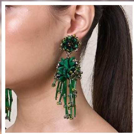
GREEN ROSA EARRINGS LB-GRRS-E