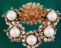
GIOVANNA BROOCH LB-GVNN-BO