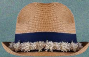
BROWN GELA HAT LB-BWNGL-HT