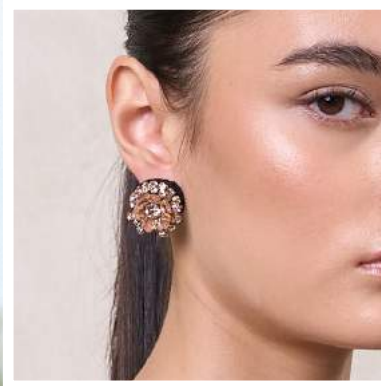
ROSE GELA EARRINGS LB-RSGL-E