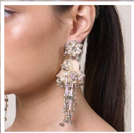
WHITE ROSA EARRINGS LB-WTRS-N