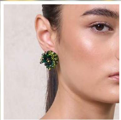
GREEN GELA EARRINGS LB-GRGL-E