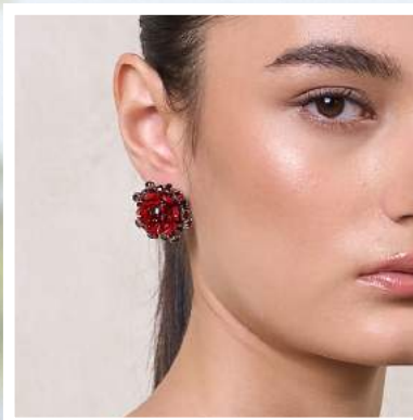
RED GELA EARRINGS LB-RDGL-E