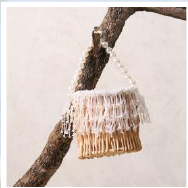
SOFIA BAMBOO BAG LB-SFBMB-BG