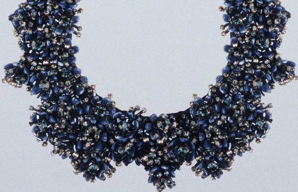
NAVY LILIES NECKLACE LB-NVLLS-N