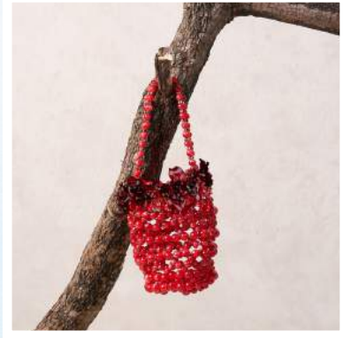
RED ROSA BAG LB-RDRS-BG