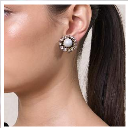
GIOVANNA EARRINGS LB-GVNN-E