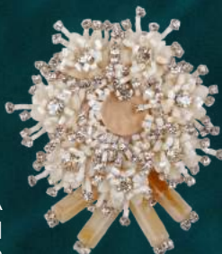
HONEY PAVIA BROOCH LB-HNPV-BO