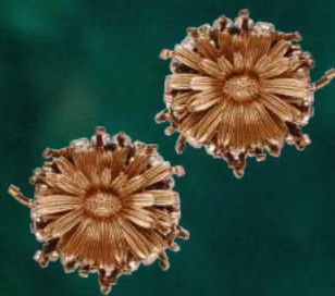
DOUBLE GIO BROOCH LB-DBLGO-BO