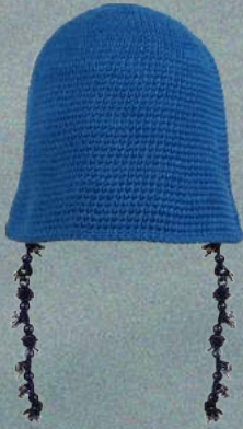
BLUE TANIA KNIT HAT LB-BLUTNKN-HT