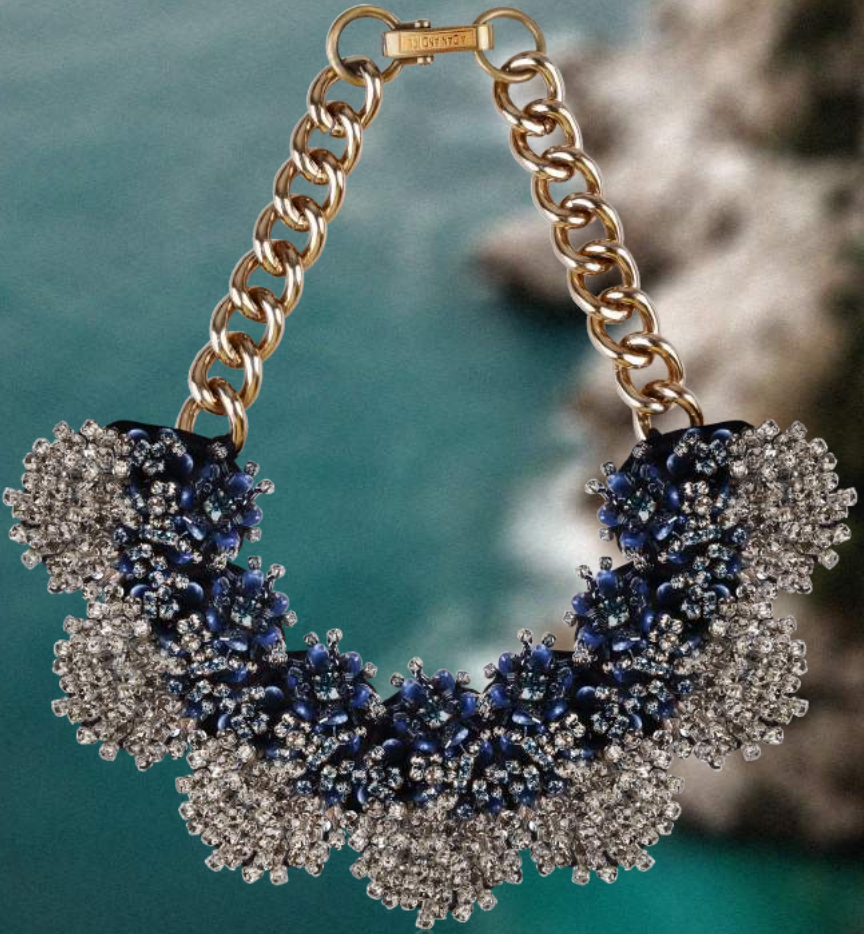
GREY PAVIA NECKLACE LB-GRPV-N